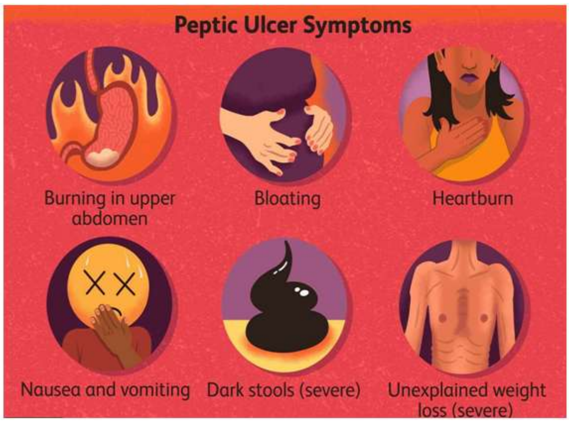
Fig-1 https://images.app.goo.gl/AMeKDYDX7DYwsS478. (16)